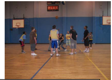
Junior High students serving as Peer Mentors at Sanders School