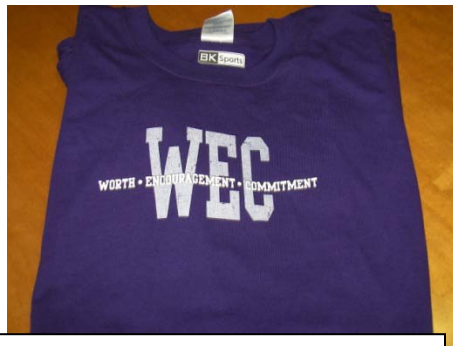
All staff received new WEC t-shirts promoting WEC = Worth, Encouragement, Commitment